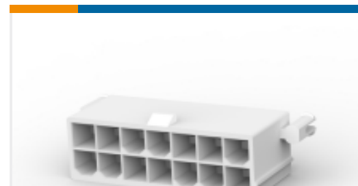
TE Part # 1-2029265-4 14P VAL-U-LOK VRTHDR W/PGS GW