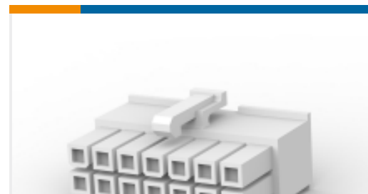
TE Part # 1-1586765-4 14P RCPT VAL-U-LOK GW