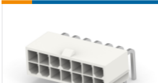
TE Part # 1-1586863-4 14P VAL-U-LOK R/A HDR GW