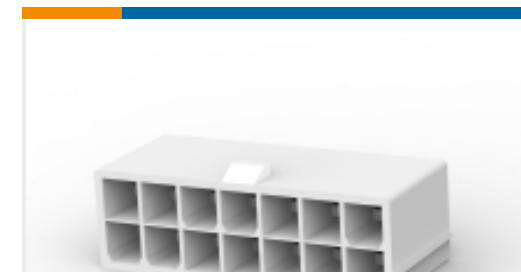
TE Part # 1-1586768-4 14P VERT HDR VAL-U-LOK GW